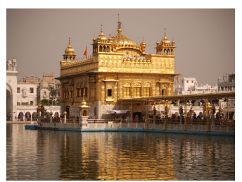
The history of the holiest Gurdwara of Sikhism, the Golden Temple of Amritsar.