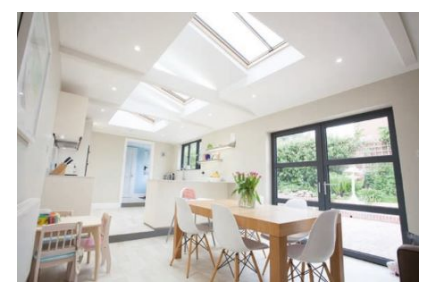
Great strength, a thin framework and a low profile finish.