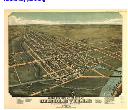
Favoured in ancient settlements and garden cities, but erased by the Circleville Squaring Company in one Ohio town.